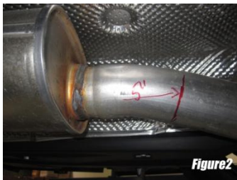
Figure 2: measure 5" inches from behind the passenger side muffler and cut

3. once you have removed the factory exhaust you will need to cut off the factory butterfly valves at specific locations. Figure 1: measure 6" inches from behind the driver's side muffler and cut